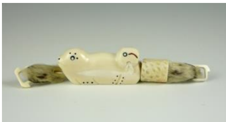
Figure 4: "Seal shaman needle case and thimble" by Jerome Saclamana. Walrus ivory, baleen, sealskin. Photograph courtesy of Maruskiya's of Nome. http://www.maruskiyas.com/store/products/seal-shaman-needle-case-and-thimble-jeromesaclamana